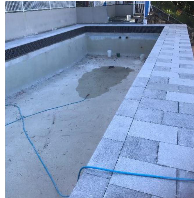
Granite tile installation