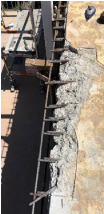
Excavate loose and flaky concrete