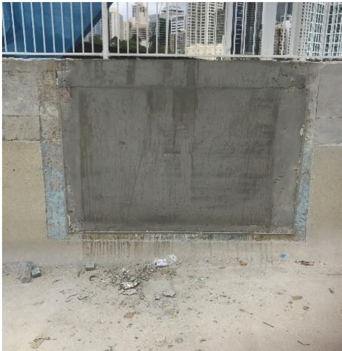
Pour construction grout