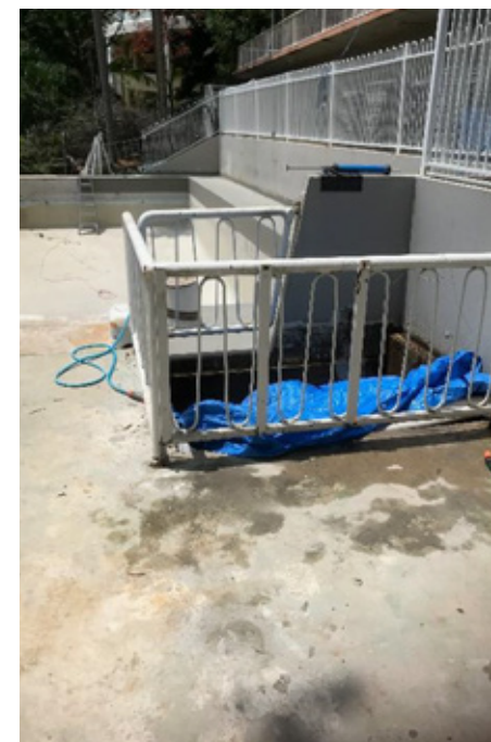
Pool Pump Pit Lid Refurbishment with new Aluminum Checker Plate Lid and matching fence