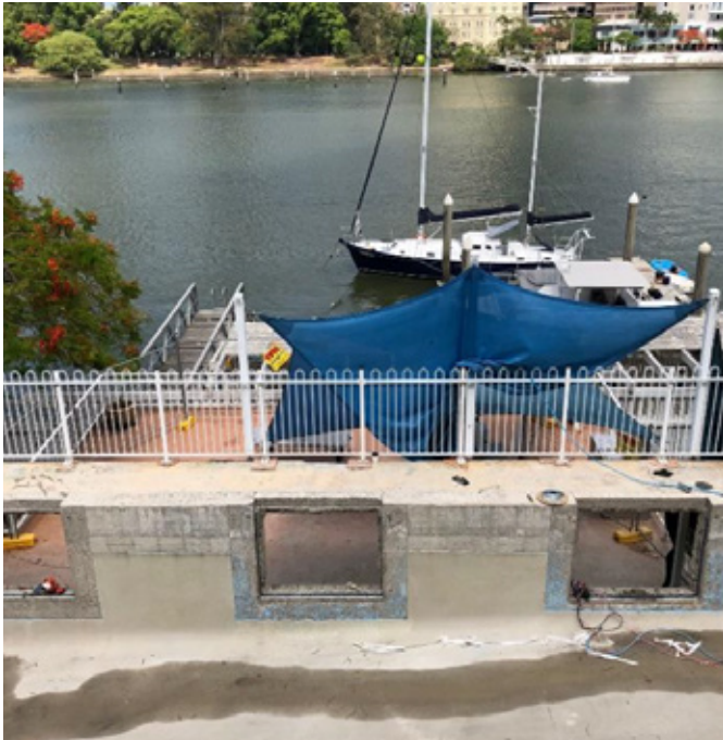
Excavating window voids