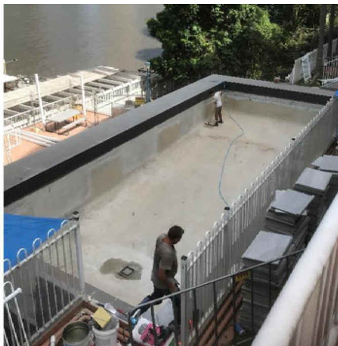
Fully waterproofed concourse and overhang slab