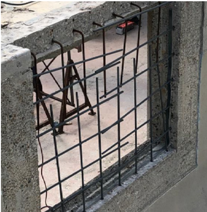
Install steel reinforcing