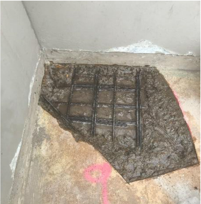
Excavate loose concrete and prepare steel