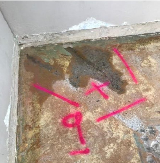
Identify repair area and mark out