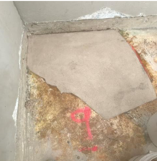
Install epoxy resin system