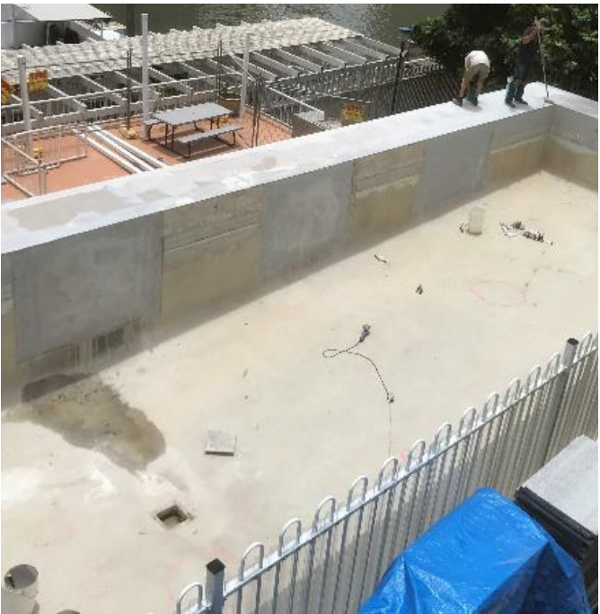
Waterproofing prepared concourse