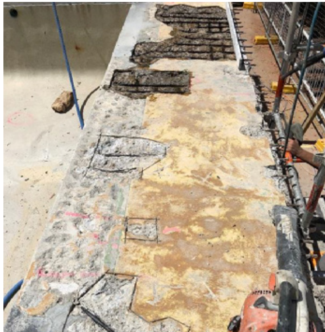
Clean and treat steel. Install new steel as required