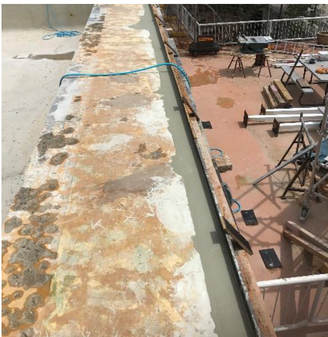
Formed up and poured using engineered mortar