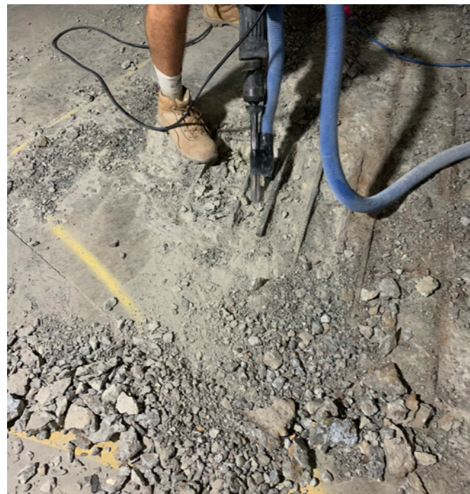
Excavation around steel reinforcing