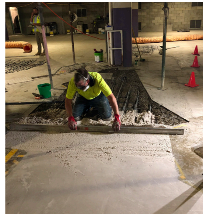
Epoxy resin/aggregate installation