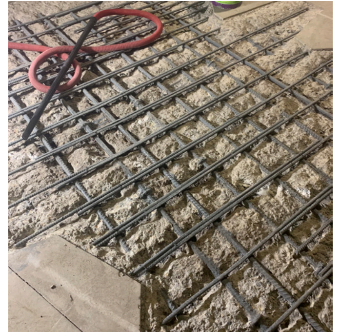
Steel cleaned and primed