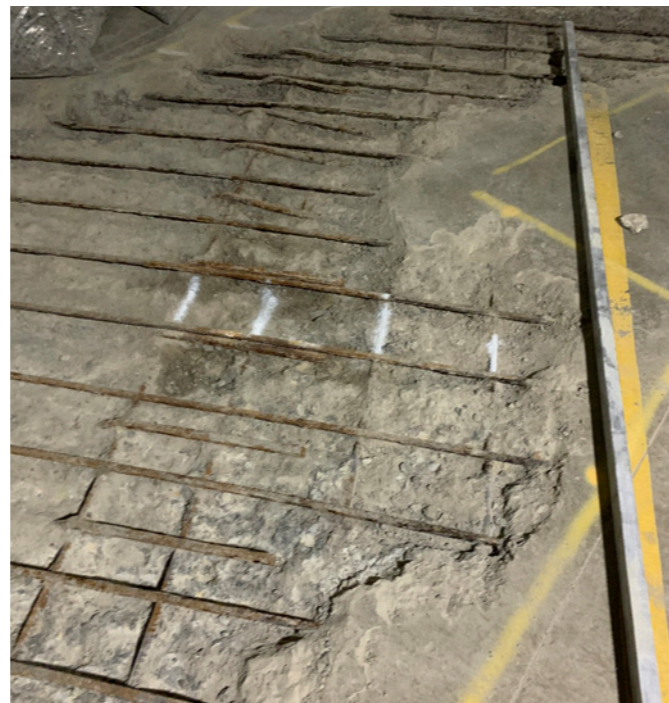
Exposed steel reinforcement during excavation