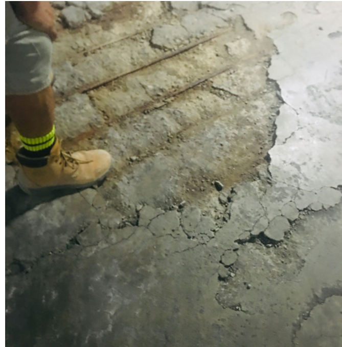
Existing slab area exhibiting severe spalling