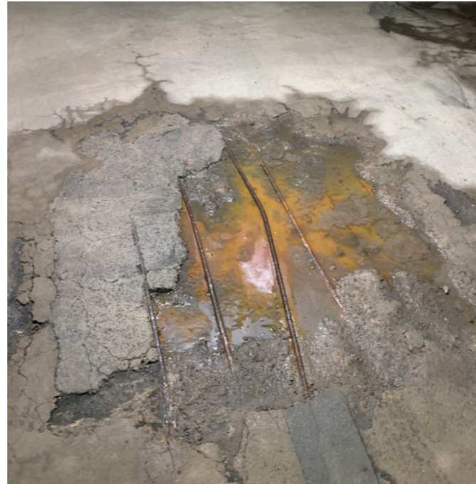
Existing slab area exhibiting severe spalling