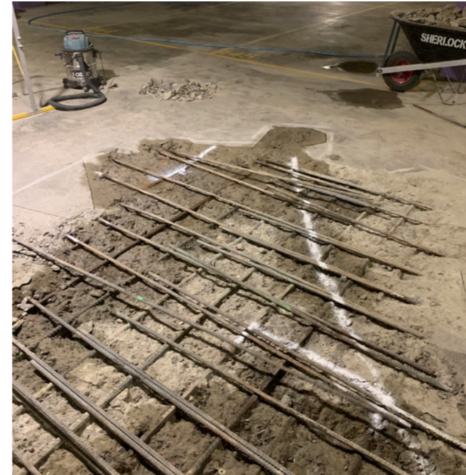
Excavated repair zone